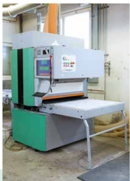
Success has many faces: The racer, his service man, the materials ...

For a decade now, this Kündig CNC is a part of the race victory's by Head.