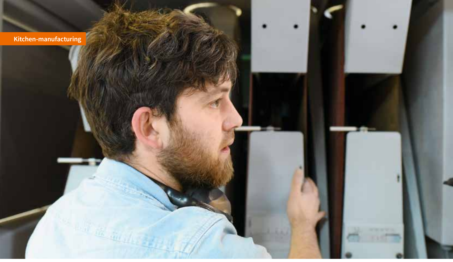
With only a few simple steps the three sanding belts of a Kündig Premium-3 1100-RRP can be changed.