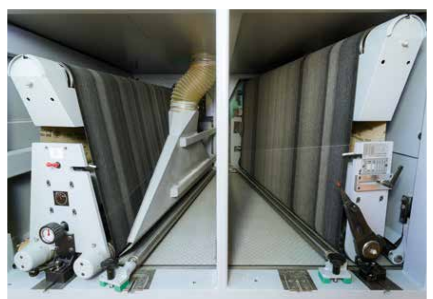
Even with an opulent 1600 mm working-width the machine is quite compact.