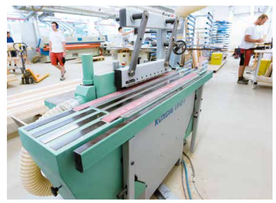
There are only a few edge sanders suitable for lacquer-sanding. Kündig's Uniq-S Lack enables this sensitive work to a very high standard.

cian counts. Some of the contractual penalties on our jobs can be life-threatening." This eventually led to the purchase of a Kündig Uniq-S Lack: "We desperately needed an edge sander suitable for highgloss coatings for a major contract. I was a bit shocked when I found out that there are just a few choices out there." Therefore his decision was pragmatic: "Anyway, only Kündig was able to deliver in a short time." After all, this wasn't too hard for Kündig the Uniq-S edge sander is a popular model produced in vast numbers. The suffix "Lack" (lacquer) means that the machine is equipped especially for processing coated surfaces. Feed rate and cutting speed can be adjusted steplessy. A sensing pneumatic sanding pad, similar to the ones used in wide-belt sanders, makes the Uniq-S Lack unique. The action of the sanding pad is controlled electronically. This means that the pad keeps its position