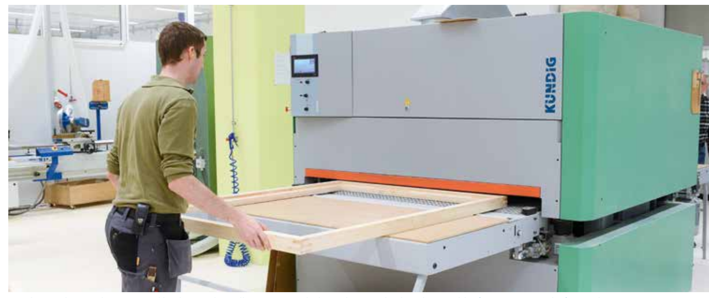
Window-sashes can be processed by the Kündig Brilliant-2 1600-RdPd-F with a standard working width of 1600 mm straight-forward. A special sanding-process enables perfect surfaces.

S wiss window-company Trütsch utilize an opulent 3000 m<sup>2</sup> production-area at their plant at Ibach: "We hope to benefit long term by increased quality and a more efficent production", explains Hans Trütsch. There is a lot of competition in the Swiss window-market he reports. It is caused by the restricted access to the European market, as Switzerland is not a member of the EU. So most manufacturers are limited to their home-market: "You must offer extremly good value for money to survive here."