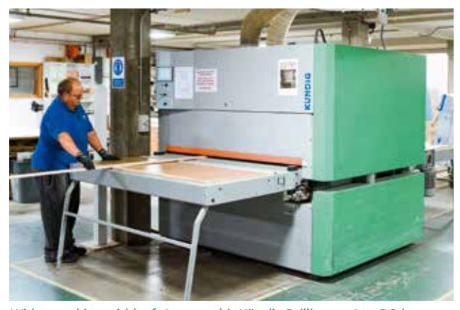
With a working width of 1600 mm this Kündig Brilliant-2 1600-RCd proves to be a flexible addition to the large Botop sander.