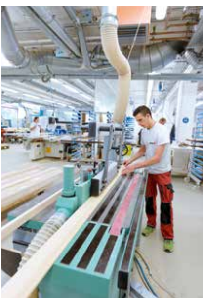
The reliability of Kündig is important for Mandler due to contractual penalties.

The employees say that the Kündig sander saves time with polishing.