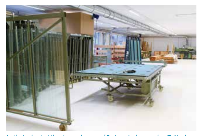
In their plant at Ibach employees of Swiss window-maker Trütsch enjoy good working conditions.