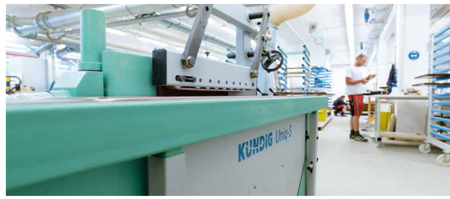
Overall three feeding-belts provide a gentle feed for delicate high-gloss parts with the Kündig Uniq-S Lack. Feedand cutting-speed has stepless adjustment to the characteristics of applied lacquer-materials.

n a valley surrounded by 3000m high Austrian mountains, the village of Amlach is situated with a population of just 42. Mandler Interiors is located there and employs nearly as many people as the village has residents. One would not expect to find one of Europe's best locations for luxurious yacht interiors here.