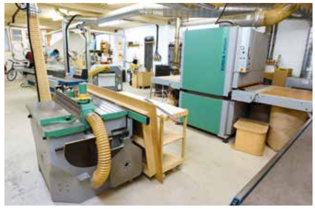
Obviously there are only approved brands at the machine-workshop. Kündig Uniq in front, Kündig Premium-2 1100-RE behind.