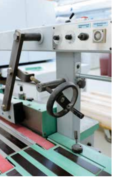
The action controlled timing avoids the sanding of rounded corners.