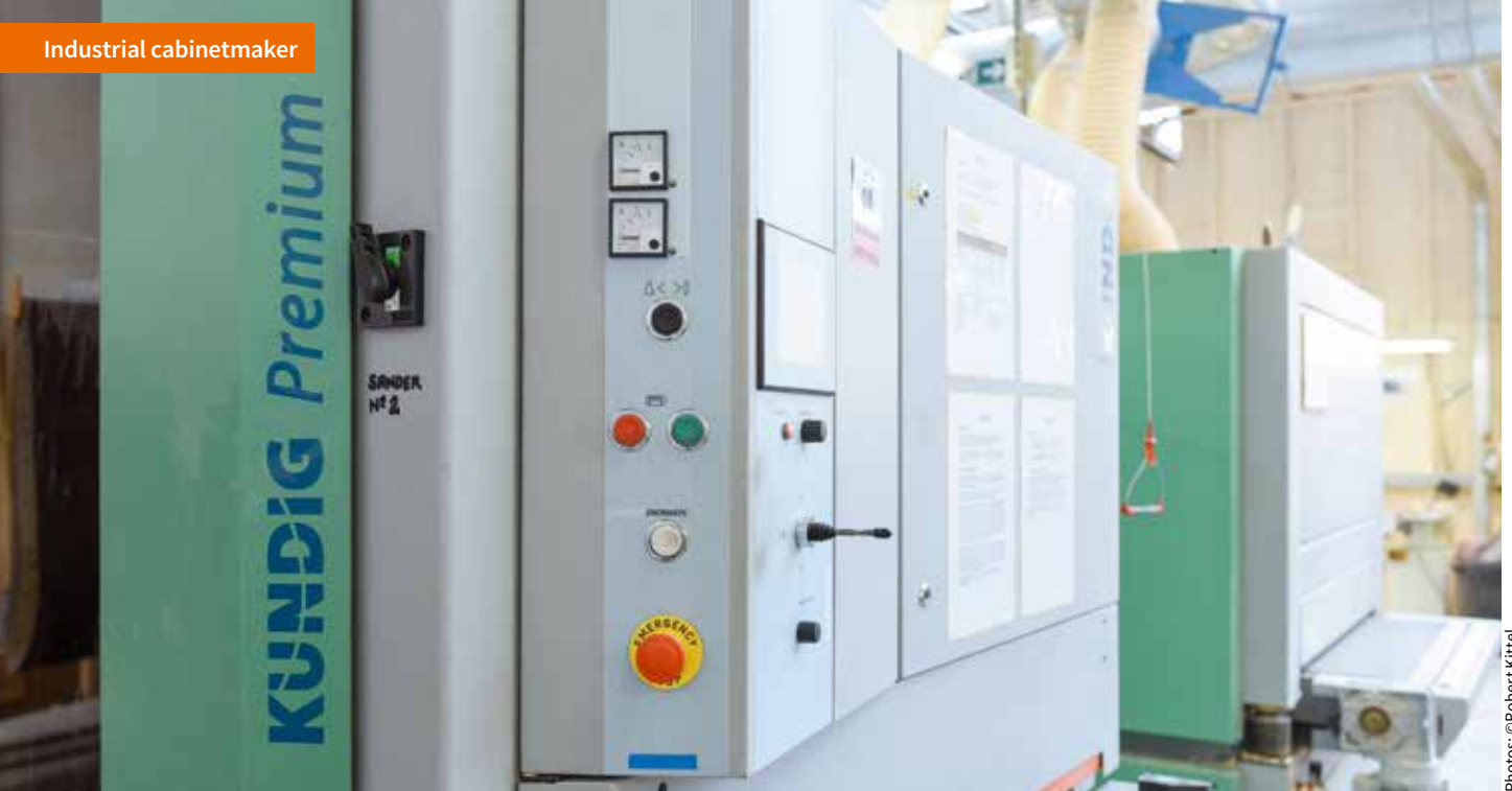
Kündig sanders are not only green on the outside. Bed-manufacturer Warren Evans is delighted by the very low power-consumption as a standard feature with the Kündig Premium.