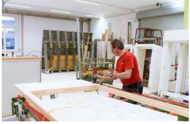
28 employees process about 2500 wooden- and wood-alloy windows per year as well as window shutters and front doors.